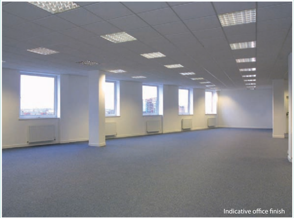
Indicative office finish